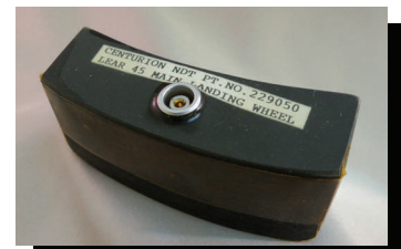
Shown with LEMO Connector

** For LEMO connector, add "L" to part number i.e. 229044L